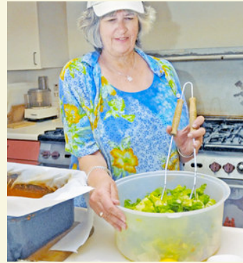
Meals on Wheels, a program of Community Bridges, Santa Cruz