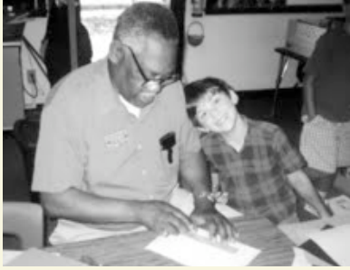
Seniors Council, Foster Grandparent & Senior Companion Program